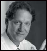
Robert Friedland Founder and CEO IVANHOE MINES

Hear growth and investment strategies from industry leaders including: