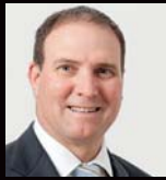
Nev Power CEO FORTESCUE METALS GROUP